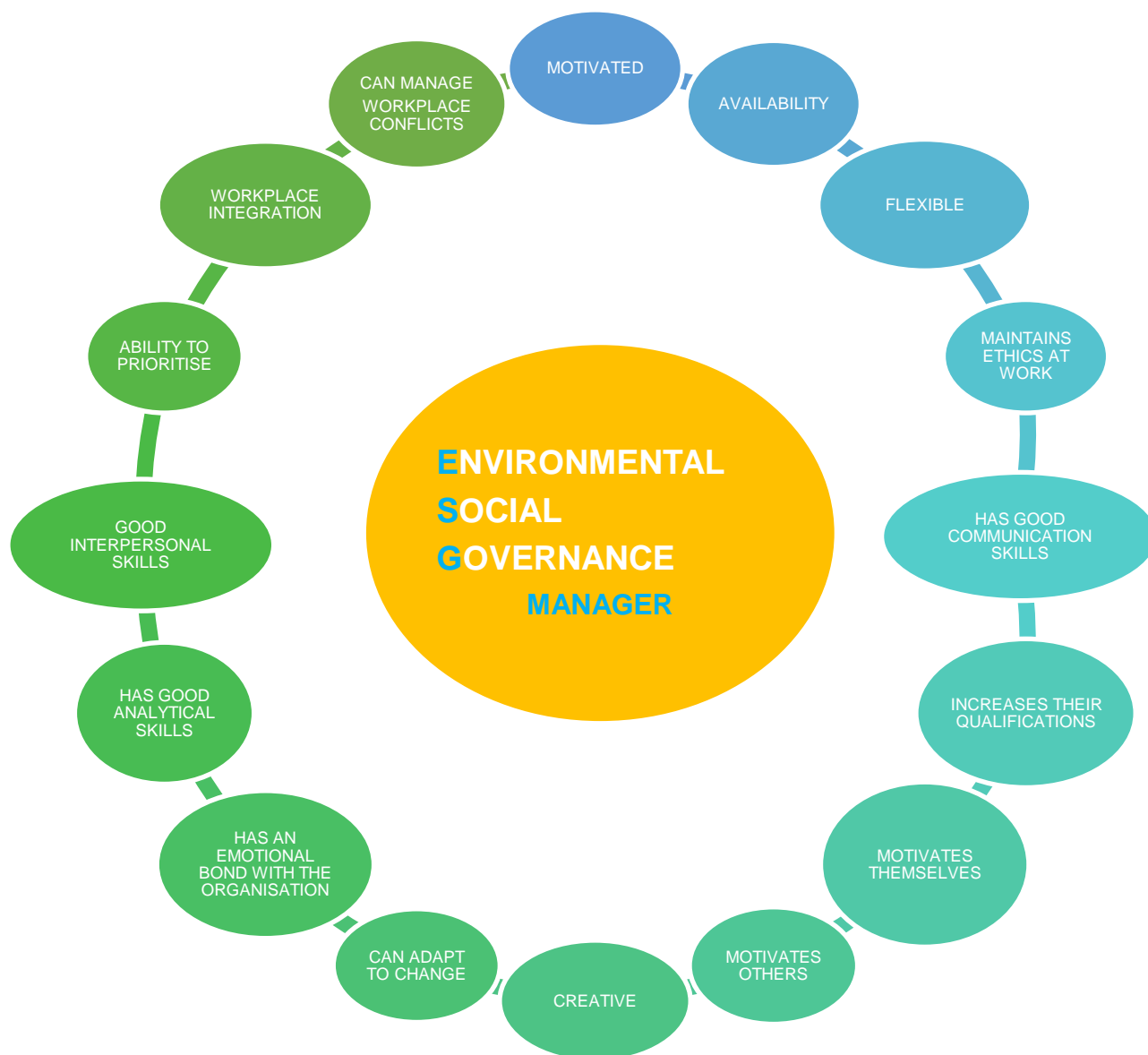
Figure 5 The competence map for ESG managers

The purpose of this chapter is to present the findings of a review of ESG manager competencies and competency requirements in the ESG sector in Ireland. The above competency map was prepared using information from a wide range of sources available in Ireland, which allowed for a comprehensive analysis of the ESG sector and the sustainability of sustainable market managers in Ireland.