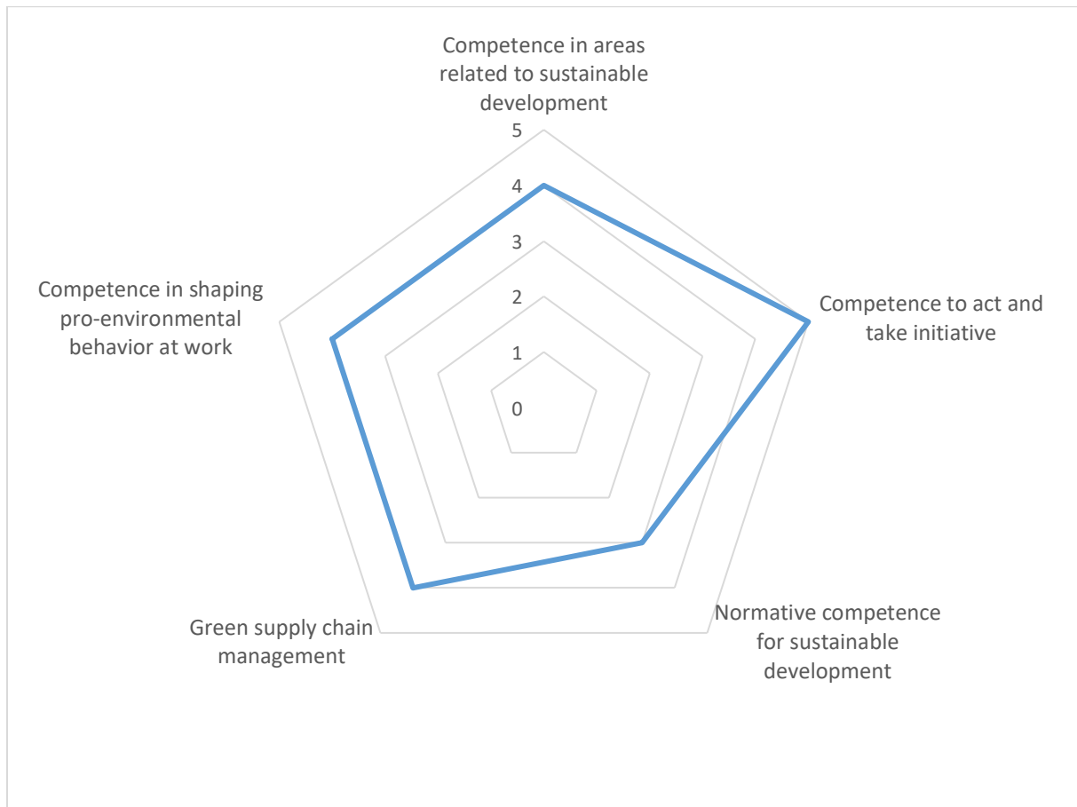
Figure 4 Competency profile of senior managers in sustainability management