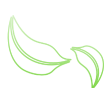
Tab. 2 Competencies in areas related to sustainable development